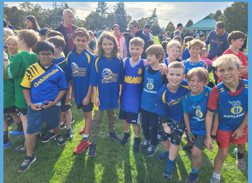
Photo Retakes Day