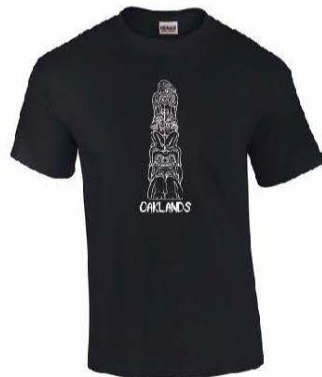
$18 INCL TAX BLACK ONLY