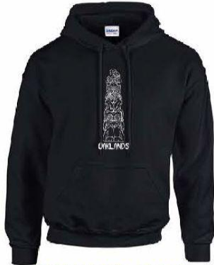
$37 INCL TAX BLACK ONLY