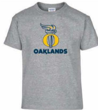
$18 INCL TAX SPORT GREY OR NAVY