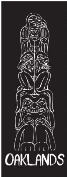
$37 INCL TAX BLACK ONLY