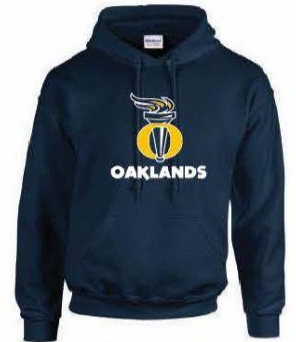
$37 INCL TAX SPORT GREY OR NAVY

ORDERS TO BE PLACED THROUGH SCHOOL CASH ONLINE