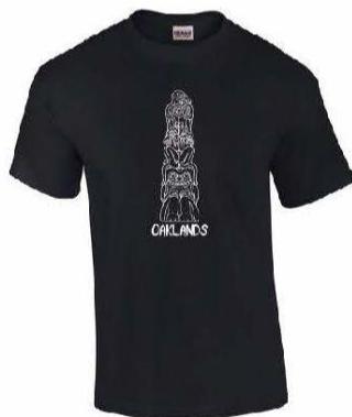
$18 INCL TAX BLACK ONLY