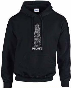
$37 INCL TAX BLACK ONLY